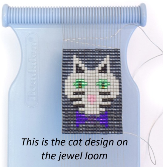
This is the cat design on the jewel loom

The cat design is 22 beads wide which means you will need 23 warp threads on your loom.